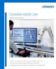
Robot Complete Care